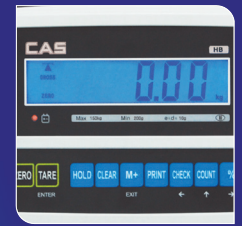
Blue backlight LCD