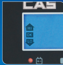
Check-Weighing Function (HI/OK/LO)